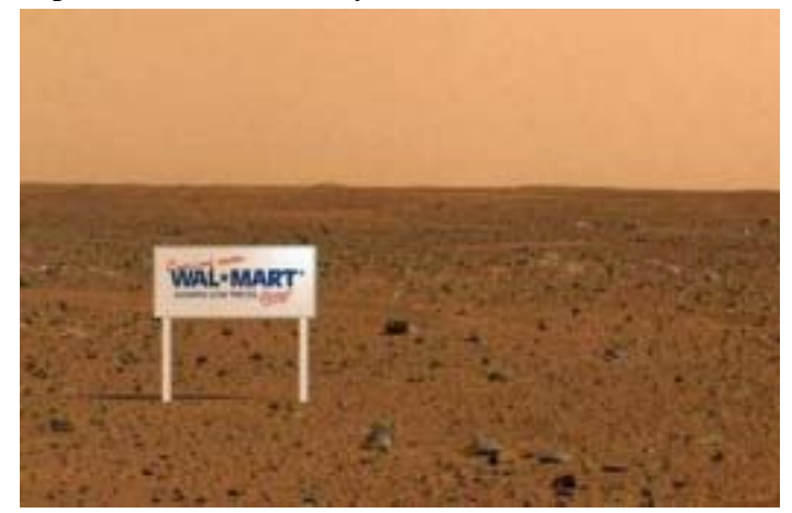
Wal-Mart opening soon on Mars. Resistance is futile(?)

A chaparral reader forwarded this amazing image claimed to be from NASA's Spirit rover currently touring the surface of Mars. It appears that even an average temperature of 76 degrees below zero Fahrenheit wasn't enough to discourage Wal-Mart's expansion in our solar system.